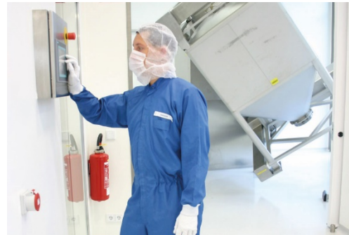
Production of boar semen extender