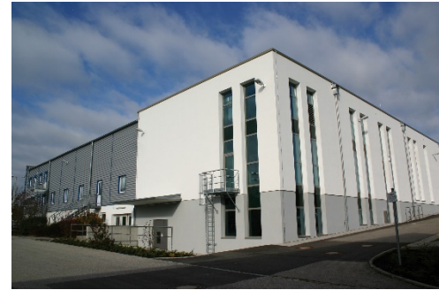
Manufacturing plant in Germany